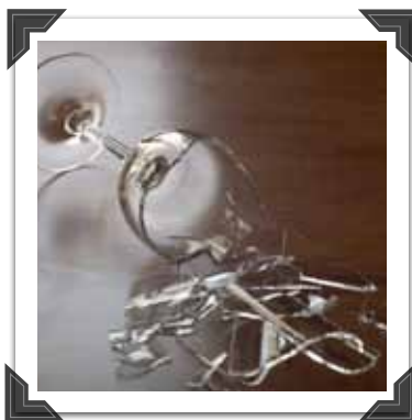
A wine glass was accidentally knocked over